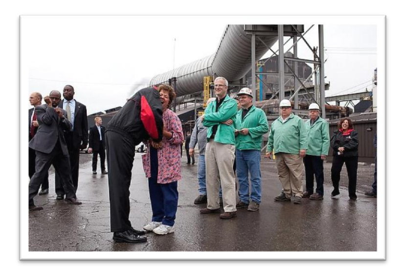
President Barack Obama greets workers at a steel plant in Youngstown, Ohio.

In addition to working with industry to spur growth and economic recovery, economic shifts often require communities to support retraining programs for workers to help them compete for new jobs. In distressed communities, it is critical to connect the workforce needs of local and regional economic drivers to the skill sets that are developed in public education, post-secondary education, and job training programs at all levels. SC2 teams are testing strategies that address the various gaps and mismatches that constrain the alignment of workforce supply and demand. These constraints may include skills gaps in which new job opportunities in emerging economies do not match with the skills of the workers; information gaps between prospective workers, who do not know about opportunities, and employers, who do not know about available workers; and location