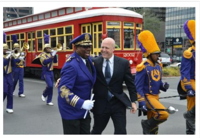
New Orleans Mayor Mitchell J. Landrieu celebrates opening of Loyola Streetcar with the St. Augustine Purple Knights Marching Band

-Deputy Secretary, U.S. Department of Transportation, John D. Porcari